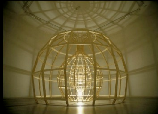
Goh Ideta Tokyo, Japan

Everyone has a freedom. It's just a matter of the way of perceiving it and the way of using it.